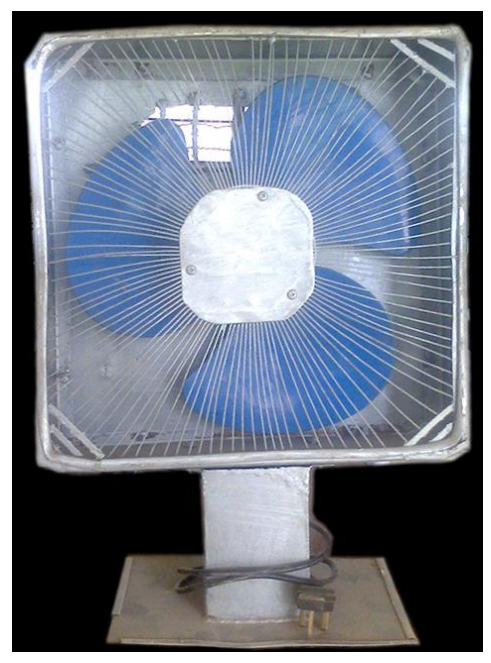
Figure 3: Prototype of the Developed Rechargeable Electric Fan